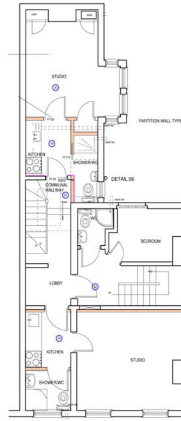
FIRST FLOOR PLAN 1no. Studio Unit 1no. Studio Unit 1 no. 2 Bedroom Unit (on 1st and 2nd floor)